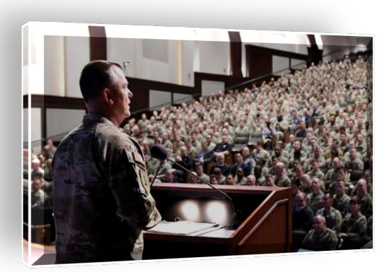
Share your stories and leadership lessons