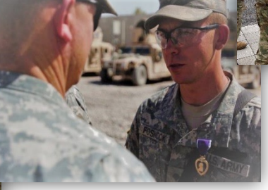
Our Nobel Calling to Service and Sacrifice