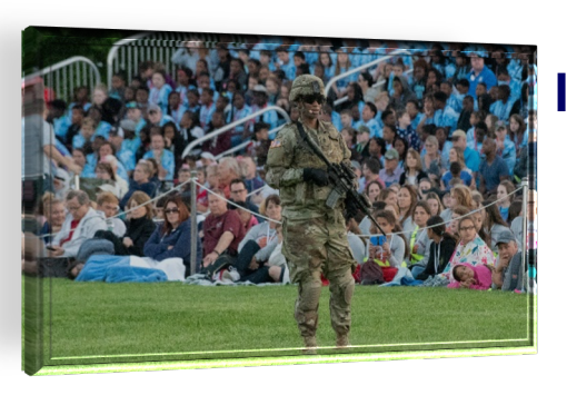
Inform America – WE ARE ALL RECRUITERS