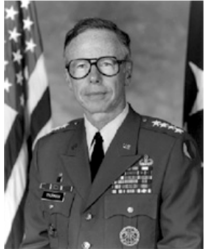
General Maxwell R. Thurman, Commanding General, 29 June 1987-1 August 1989

Vision 91 examined the central question of how the command should position itself to meet the challenges of 1991 and beyond. That period would be a time of substantial manpower and funding constraints. Vision 91 sought to address the evolution of doctrine, especially in the joint arena; a more focused force design; a system-of-systems approach to materiel development; full service leader development; tough, realistic training; and well-developed mission support capability.