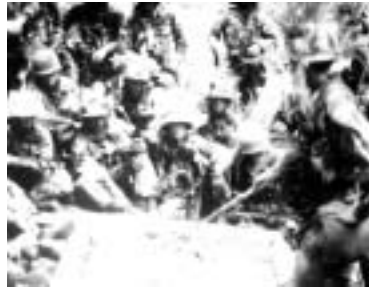
Reserved Officer's Training Corps (ROTC), Fourth Region, Capstone Exercise in July 1985.

doctrinal literature program included soldiers' manuals that set forth what the Army expected a soldier to know and be able to perform at each skill level. The new program also included commanders' manuals, field manuals, "how to fight" manuals, technical manuals, and training circulars. To meet increasing shortages in manpower, DePuy and Gorman greatly expanded a training extension course program begun under CONARC and designed to export training to the field.