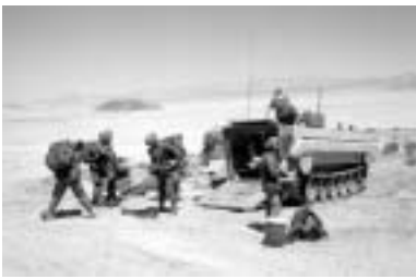
Opposing Force (OPFOR) prepare to move forward during an exercise at the NTC. TRADOC began to develop the concept for the training center in 1976.