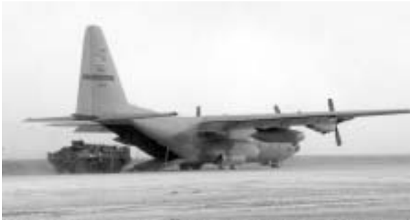
The Stryker interim armored vehicle rolls off a C-130 during exercises in 2002

As TRADOC commemorated its 30 th anniversary, a number of weapons and equipment projects underway promised to support the transforming Army deep into the 21 st century. Of special importance was a vehicle for the