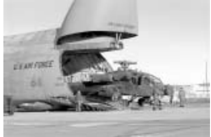
Airlift considerations formed a large part of joint USAF/US Army joint doctrine efforts. Here An Air Force C-5 unloads the Army's Apache attack helicopter.

The 31 Initiatives program, which addressed seven basic areas of AirLand combat, included a number of joint projects already under way. Extending to 1988, the program furnished a high-level forum and focus for the solution of difficult bi-service issues. An initiative on intratheater airlift led to the establishment in 1984 of the Airlift Concepts and Requirements Agency (ACRA) at Scott Air Force Base, IL. In January 1986, the two services established the Army - Air Force Center for Low Intensity Conflict, or CLIC, at Langley AFB, VA.