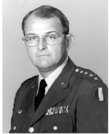
General Donn A. Starry, TRADOC Commanding General, 1 July 1977- 30 June 1981

With regard to doctrine, Starry sought to answer what had come to be substantial discussion and controversy over the “active defense” concept of the 1976 version of FM 100-5. He brought with him to TRADOC the idea of an integrated and extended battlefield—the “central battle”—to engage the enemy not only at the point of attack but also in depth. Another revision of FM 100-5 began almost immediately. The concept required extension of the combat developments period out eight to ten years, departing from DePuy’s focus on near-term problems. Following this approach, Starry hoped to harness the combat power of the oncoming generation of weapons and other modernization efforts.