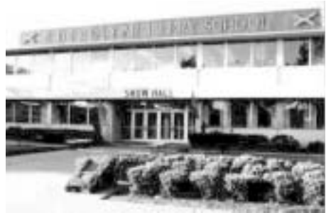
As with a number of TRADOC Schools, the Field Artillery School at Fort Sill was a component of the branch center at which it was located.

In 1973, TRADOC had 16 Army branch schools. Eight schools — the Air Defense, Armor, Engineer, Field Artillery, Infantry, Quartermaster, Southeast Signal, and Transportation Schools — were components of their respective branch centers, at which they were located. Three other branch