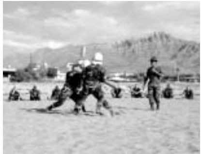
Recruits at Fort Bliss, TX, learn hand-to-hand combat skills.