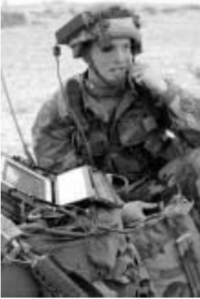
A radio telephone operator at Fort Lewis, WA, uses the dismounted Soldier System unit during an AWE in March 1997.

experiments” (AWE) to carry through a sequence of experiments and simulations to examine the emerging digitization concept. Bearing names such as Desert Hammer VI, Roving Sands, Prairie Warrior, Mobile Strike Force, Focused Dispatch, and Warrior Focus, these exercises and experiments—from platoon to theater levels—were variously directed by the TRADOC Battle Laboratories and the National Simulation Center at CAC.