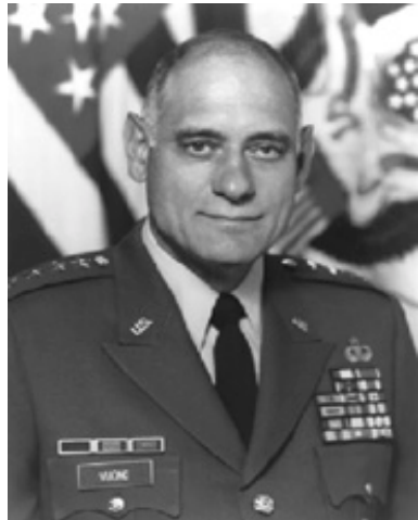
General Carl E. Vuono, Commanding General, 30 June 1986-11 June 1987

Efforts in force modernization concentrated on improved application of the Concept Based Requirements System and a new emphasis on a system of systems approach to equipment modernization. Leader development was