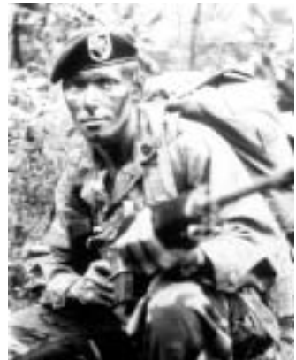
A significant aspect of the Army of Excellence was the strengthening of Ranger and Special Forces units. In April 1987, the Special Forces were established as a separate Army branch.

In the newly destined Army of Excellence, TRADOC force designers reduced the heavy divisions to structures of approximately 17,000. Significant transfers from division to corps in field artillery, air defense artillery, and combat aviation left the divisions smaller with less organic combat power. The redesigned corps thus provided a more powerful fighting organization at the operational level of war. The Army of Excellence design of heavy divisions and corps moved Army tactical organization more fully into consonance with doctrine at the most significant level of organization.