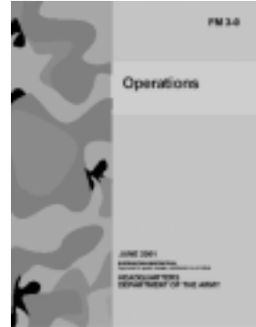
FM 3.0, Operations, published in June 2001, reflected in both its joint numbering scheme and its guidance, the increasing need for joint doctrine.

that was decisive across the full spectrum of conflict on the 21 st century battlefield. The SWG particularly addressed the challenges raised by the revolution in computer and graphics technology. A TRADOC brigade cell at Fort Lewis cell tracked and analyzed two Interim Brigade Combat Teams (IBCT) at Ft. Lewis, WA as they tried new concepts for the future battlefield. The new vision resulted in a complete revision of the 1993 edition of FM 100-5. To emphasize the break with the past, the joint numbering system of 3.0 was adopted for the new manual, which was cognizant of the changes in the nation's geo-strategic position. It clearly addressed the problems of deployment and asymmetric warfare and the need for joint operations in nearly every aspect of operations, from major theaters of war to humanitarian relief. The "Transformation" FM 3-0 was published in June 2001.