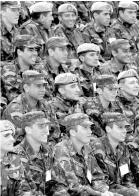
U.S., Chilean, and Argentine soldiers train together in South America. TRADOC relations with South and Central American armies has strengthened since the command's founding in 1973.