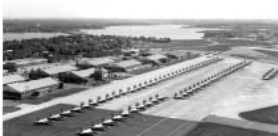
As both the Air Force and the Army embarked on ambitious new weapons development efforts in the 1970s and 1980s, joint concepts became increasingly important. Here new F-15s sit on the airstrip at nearby Langley AFB in 1977.