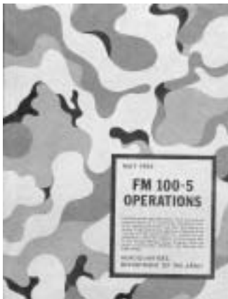
The Army's "capstone" AirLand Battle doctrine as originally defined in the 1982 version of Field Manual (FM) 100-5, Operations, was revised in 1986.