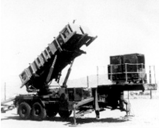
These vehicles, visually modified to resemble Soviet vehicles, were used by the “opposing force” to provide opposition for Task Force XXI during AWE exercises.

tems Test Evaluation and Review (MASSTER) at Fort Hood, Texas.