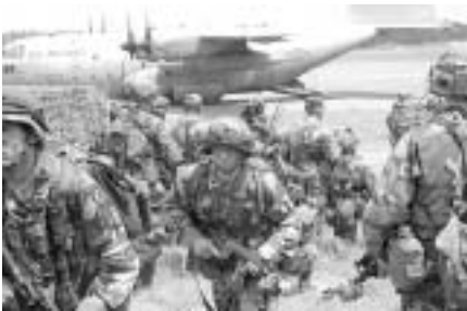
Soldiers arrive via a C-130 aircraft for training at the Joint Readiness Training Center at Fort Polk, LA

The NTC was a joint TRADOC-FORSCOM project. The major features of the training center were the employment of MILES for casualty assessment; a sophisticated data collection system for exercise control and data collection; a TRADOC Operations Group; a superbly trained opposing force (OPFOR); expert exercise observer-controllers; after action reviews of unit performance; and take home packages designed to aid units in correcting deficiencies while training at home station. The success of the NTC in training heavy mechanized forces led the Army to establish a similar facility for the training of light forces. The Joint Readiness Training Center (JRTC) opened, on a temporary basis, at Fort Chaffee in October 1987. Like the NTC, it featured a TRADOC Operations Group and an OPFOR. Unlike the NTC, the JRTC was completely a TRADOC project in its early days and until the light training center moved to a permanent home at Fort Polk in 1993. At that time the JRTC became a TRADOC-FORSCOM effort like the NTC. In 1988, the Army began to plan for a Combat Maneuver Training Center (CMTC) at