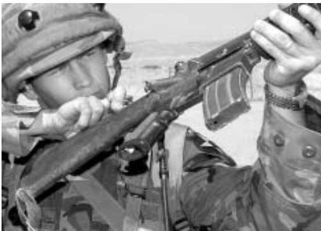
The largest joint military experiment ever held, Millennium Challenge 2002 combined field forces and computer simulations to test and validate joint and service-specific warfighting doctrine.

After the attacks of September 11, 2001 on the World Trade Center and the Pentagon, TRADOC also had to support the war on terrorism. The command produced O&O for the Army on force protection, and assessed the impact on the changed world situation on all other aspects of doctrine development. Especially critical was the development of joint doctrine which had in the past proceeded slowly and without the desired integration. TRADOC's leadership expected that the command would become the Army element in the new U.S. Joint Forces Command.