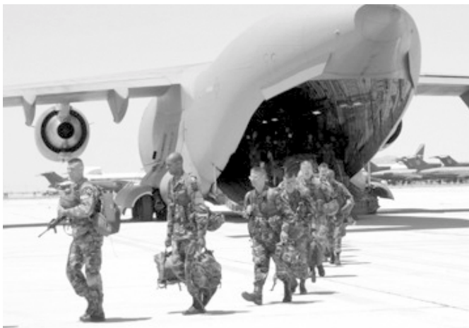
Soldiers prepare for ATEx02, Army Transformation Experiment, part of the Army's participation in Millennium Challenge 2002. MC02 was the largest joint peacetime exercise ever held.

In October 1999, Atlantic Command, which had been established in 1993 as a regional command with joint authority, was re-designated United States Joint Forces Command (USJFCOM). In addition to its other responsibilities, JFCOM was given the mission of joint training and transformation as outlined in the Department of Defense's Unified Command Plan. As the Army's trainer, TRADOC coordinated closely with JFCOM. In 1999, JFCOM absorbed the Joint Warfighting Center into its Joint Training Center at Suffolk, VA. In 2002 TRADOC participated in Millennium Challenge, the U.S. military's largest joint peacetime exercise to date, which was controlled by JFCOM. TRADOC had the Army lead for Millennium Challenge 02 and coordinated with JFCOM to provide management oversight for the overall