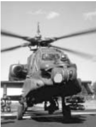
The Apache was the Army's day/night, adverse weather, attack helicopter.

The modernization wave that had begun in the immediate post-Vietnam era crested in 1983. From that point in time development would be slower and more sporadic. By the late 1980s, modernization planning was less dramatic and more aimed at coordinated effort and overall reduced budgets and available resources. For instance, in 1986, the Department of the Army commissioned the Armored Family of Vehicles Task Force to examine the next phase of modernization. The emerging concept was that of an armored family of vehicles to be built around two common chassis. A total, phased replacement of the tracked and wheeled fleet