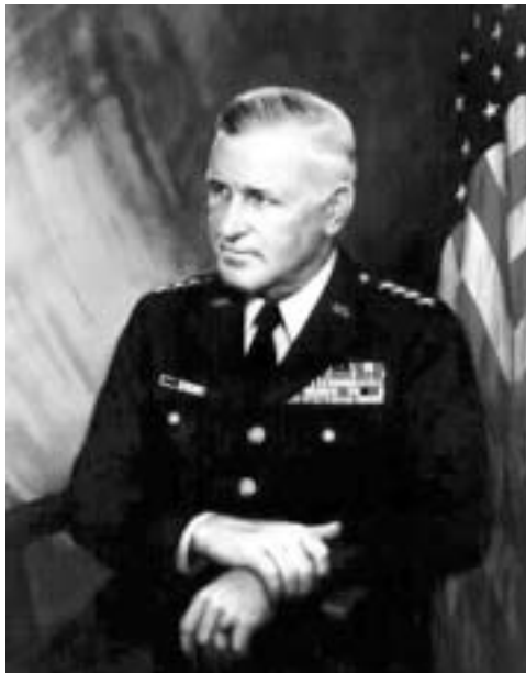
General Creighton Abrams, Chief of Staff of the Army, October 1972-September 1974, directed the STEADFAST initiative that created TRADOC.

The Department of the Army established TRADOC on 1 July 1973 at Fort Monroe, Virginia, as part of the major STEADFAST Reorganization of the Army in the United States, brought to completion that year. The STEADFAST initiatives, directed by General Creighton Abrams, Chief of Staff of the Army, attempted to solve difficult command and control problems in the Army establishment evident in the early 1970s. The span of control of TRADOC's predecessor, the Continental Army Command, or CONARC, reached through the headquarters of the numbered armies to the corps and divisions and included most of the major Army installations in the United States. Given such a wide control span, together with responsibilities for both the training and education establishment and for unit readiness, CONARC obligations were too broad for efficient focus..