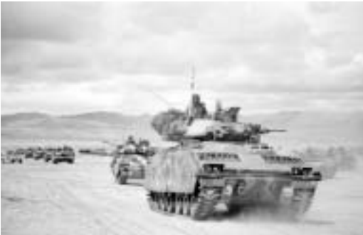
In the mid 1970s, action at TRADOC focused on the development of a new generation of weapons such as the Bradley Fighting Vehicles and the M1 Abrams tanks shown here at the NTC.

TRADOC designed the “TOE Army,” the division, corps, and theater elements and all the 1,200-odd various tables of organization and equipment for “type” units, platoon through corps and above that made up the Army in the field. Design and adjustment of the organizations of the tactical Army was a continuous process, as new or upgraded weapons or equipment were introduced or when doctrine forced changes to tank platoons, mechanized infantry