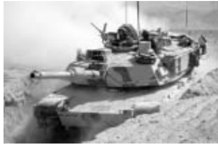
The M1A1 Abrams main battle tank was one of the big 5 weapons systems that TRADOC helped to develop.

As management techniques and strategies were being devised and emplaced, the 1970s and 1980s witnessed the launching of one of the most massive modernization programs in the history of the Army. The Big Five systems of greatly increased combat power included the M1 Abrams main battle tank, the M2 and M3 Bradley fighting vehicles, the Black Hawk and Apache helicopters, and the Patriot air defense missile. The Multiple Launch Rocket System was also developed and fielded as were individual soldier' equipment and electronic warfare protection equipment. Anticipating a smaller force after the Vietnam drawdown, the ability to catch and keep the technological edge in weapons and equipment was deemed imperative.