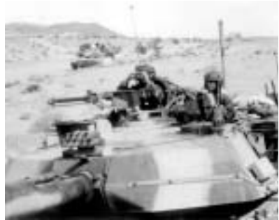
M1 Abrams equipped with the Multiple Integrated Laser Engagement System, always known as MILES, is shown here training at the National Training Center, Fort Irwin, CA

training in the field. One of these was known as SCOPES, for Squad Combat Operations Exercise Simulation. SCOPES was designed to eliminate the judgment of umpires that was highly subjective, and featured a 6-power telescope mounted on a rifle with numbers affixed to each individual soldier for the identification of casualties. A similar system for training tank crews called REALTRAIN had a 10-power scope. In the early-to-mid 1970s, TRADOC began developing a more sophisticated tactical engagement simulator for use in force-on-force field training exercises. That system, the Multiple Integrated Laser Engagement System, always known as MILES, revolutionized collective training in the Army. In 2003, the system—after several upgrades—continued to be the Army’s most innovative and effective training device.