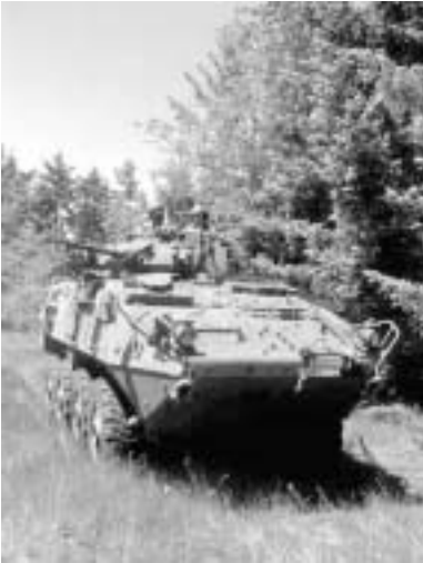
An Interim Brigade Combat Team (IBCT, later renamed Stryker BCT, or SBCT) trains at Fort Lewis. The IBCT provided the "test bed" for many of the Transformation initiatives and would form a bridge from the legacy force to the objective force.

Looking to the Army of the 21st century, TRADOC trainers considered their challenge to be maintaining the essence of the Army's education and training system and the utilization of the best combinations of live, virtual, and constructive simulations and simulators. That strategy was designed to unite the many ongoing training efforts into a clear, coherent vision to produce trained and ready units into the next century. To achieve the Army's objectives in Force XXI to transform the force from an Industrial Age Army into a knowledge and capabilities based power projection Army, TRADOC had concurrently to develop the means and methods to train and sustain the force.