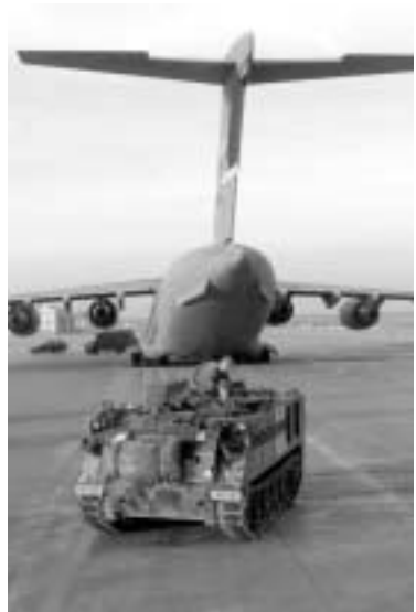
Casualty evacuation often demanded the efforts of more than one service. Here an Air Force C-17 cargo plane unloads an Army ambulance

Low intensity conflict (LIC) was a category of engagement short of all out war and consisted of diverse and unconventional military operations. The 1993 edition of FM 100-5, Operations , characterized LIC as Operations Other Than War (OOTW). For most of the 1970s and 1980s, low intensity conflict defined the whole realm of operations below high- and mid-intensity conflict. It received considerable attention by TRADOC doctrinal developers from the early 1980s on, as defense policy turned increasingly to that sector of military operations. Increasingly through the decade, low intensity conflict, or LIC, emerged as a major concern. In July 1985, TRADOC joined the Air Force and other agencies in the major Joint Low Intensity Conflict Study that was released in 1986. It summarized previous efforts and became a springboard for subsequent Army and joint doctrinal formulation and further work. The study revealed the definition of LIC was too broad to accurately quantify the problem.