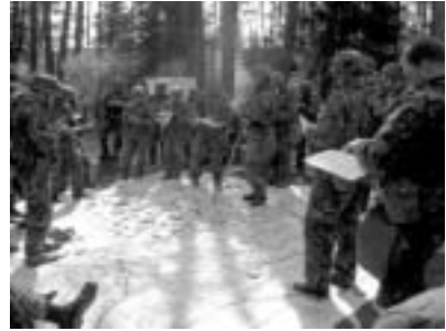
An observer/controller (OC) team at the Combat Maneuver Training Center at Hohenfels, Germany, assists the BCT commander with training through observation, control of the simulated battlefield, and after action reviews (AAR).

In the summer of 2002, the NTC became the focus of the U.S. Army's participation in Millennium Challenge (MC/ATEX 02), the first major joint "experiment" ever conducted. The Army conducted exercises with the new Stryker interim armored vehicle to test its deployability, especially when airlifted by a C-130 aircraft. The TRADOC battle labs at Forts Gordon, Benning, and Leonard Wood also conducted experiments in satellite communications, intelligence, command and control, and terrain mapping. Lessons learned from Millennium Challenge would develop a new joint training transformation project known as Joint National Training Capability (JNTC) which would focus on the upgrading and certification of service training ranges for joint training.