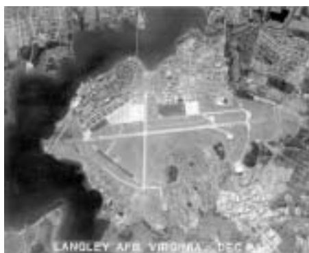
TRADOC's participation in joint Army/Air Force initiatives such as the ALFA, ACRA, and CLIC was, in part, because of the proximity of Langley Air Force Base, seen here in a 1985 aerial photo.

ALFA work was also incorporated into the NATO doctrine of battlefield air interdiction. TAC-TRADOC work resulted in a November 1984 agreement on joint procedures for offensive air support. Joint suppression of enemy air defenses (J-SEAD) was another significant project in cooperation with U.S. Readiness Command; a joint concept was published in April 1981. In December 1982, the three headquarters published the Joint Attack of the Second Echelon, or J-SAK, which delineated attack procedures by level of command for the identification and attack of the enemy follow-on echelons. The project lay at the heart of TAC contributions to the deep attack aspect of the Army's AirLand Battle doctrine published in August 1982. TAC-TRADOC projects expanded in the late 1970s to joint tactical training projects, tests, and