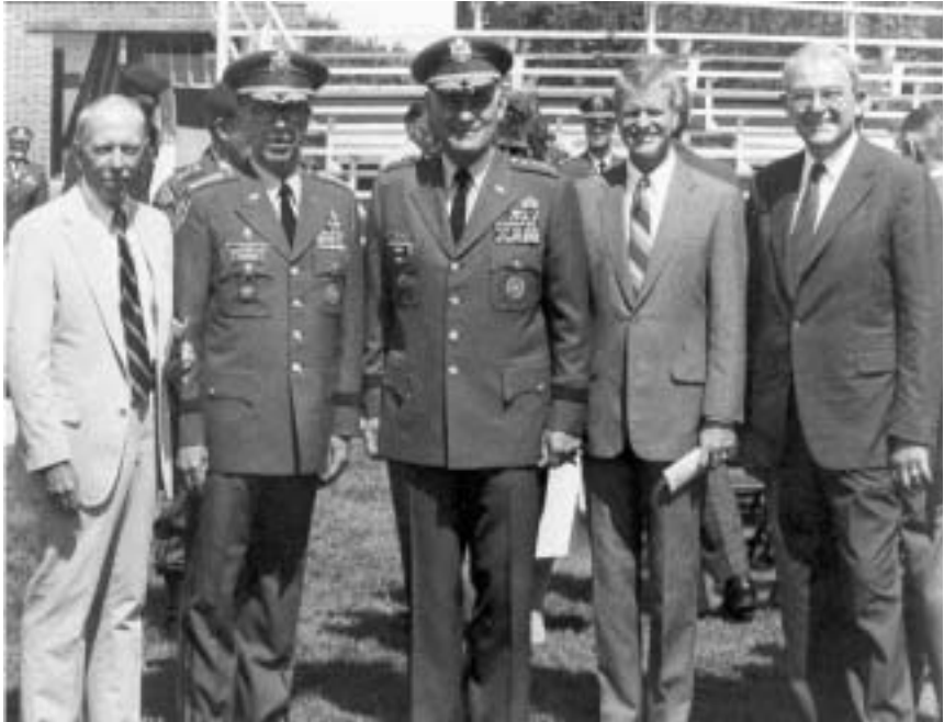
Five former TRADOC Commanders gather at Fort Monroe.

At the thirty-year mark, eleven commanders had served the U.S. Army Training and Doctrine Command. Each led the command from a perspective based on personal and professional experience, the evolving international situation, national priorities, and the defense fiscal environment. Each impressed upon the organization his own vision and style of management, within the framework of his commander's intent.