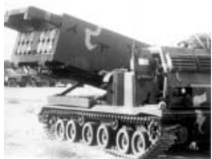
A significant development for TRADOC was the fielding of the air defense system known as the Patriot.

TRADOC took a “total systems” approach to weapons development, bringing trainers, logisticians, and personnel managers into the process early. The total systems methodology