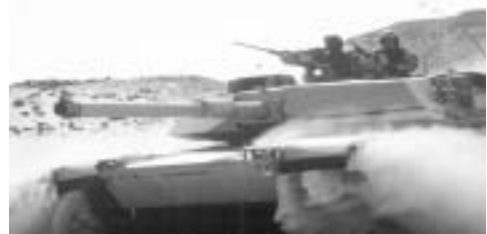
TRADOC focused the development of the Army's weapons and equipment. Here the M1A1 "Abrams" tank is shown in the Gulf War.

The TRADOC-FORSCOM arrangement solved the span-of-control problem, put combat developments back into the schools, and focused the development of the Army's tactical organizations, weapons and equipment, doctrine, and the training of soldiers in that doctrine, in one command. Making the better alignment work was the first task facing TRADOC in 1973. The second task was to assist in the designing, shaping, and training of an Army dispirited by its experiences in Southeast Asia. Facing it was not only a situation of psychological and institutional uncertainty, but a dangerous and growing strategic threat to the North Atlantic Alliance. The situation was exacerbated by what military observers in the United States and Europe described as a lost decade of weapons development by the U.S. Army, stemming from a ten-year concentration on fighting and equipping for the Vietnam conflict.