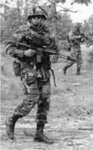
TRADOC institutionalized new directions for the Army organized around information and digital communications. Here a soldier trains at Fort Hood as part of Force XXI.

real-time intelligence, detection, target acquisition, and communications technology.